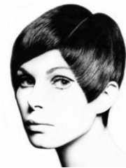
The Sassoon Cut: Architecturally Inspired

The story of Vidal Sassoon reads like a character out of Dickens.